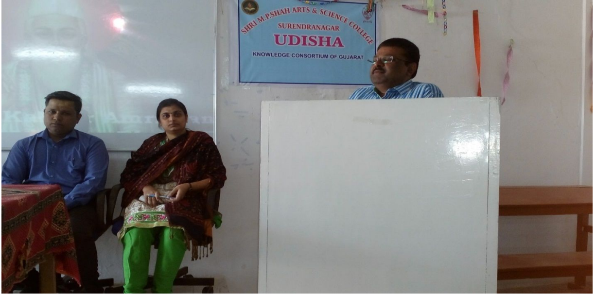
Udisha- Soft Skills and Placement Training innogration, 13-02-2017