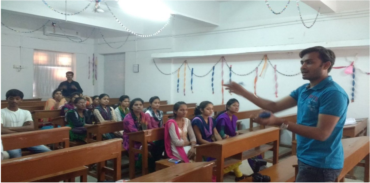
Lectures on Communication Skills on 15-02-2017