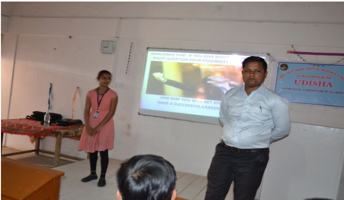
Lectures on Mock Interview on 17-02-2017